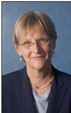
Harvard President Drew Gilpin Faust

One of the major events this month was the inauguration of the new president of Harvard University, Drew Faust, on October 12 th .