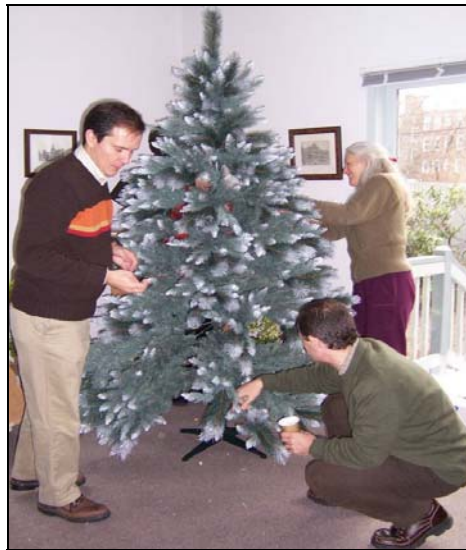
Assembling the Tree

On December 6, 2006, researchers decorated the RCC tree. Spaniards were introduced, by the Program Coordinator, to hot chocolate with marshmallows to add to the festivities.