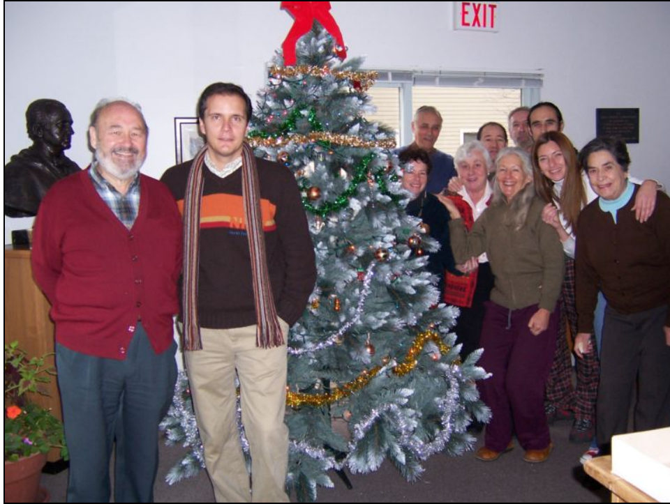
The Group & The Decorated Tree (The statue of King Juan Carlos is in the background)