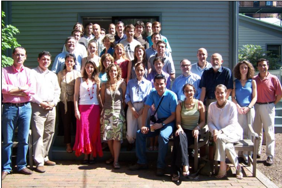
Business Management Seminar Group July 17, 2006